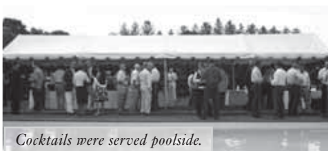
Cocktails were served poolside.