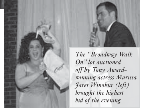
The "Broadway Walk On" lot auctioned off by Tony Award-winning actress Marissa Jaret Winokur (left) brought the highest bid of the evening.

amfAR supporters raised a glass at Manhattan's High Bar on September 17 for amfAR Around Town: Socializing With a Conscience, a new series for young philanthropists.