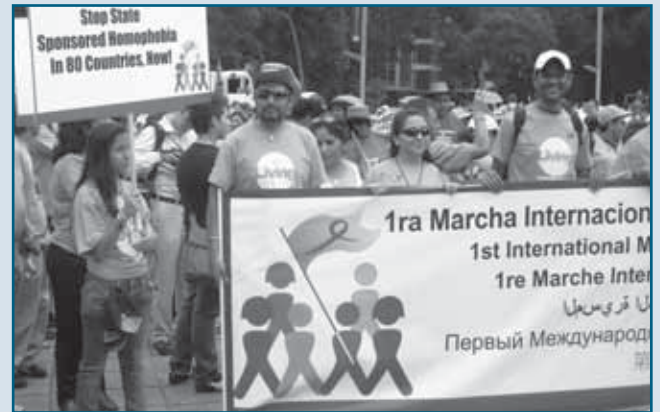
The First International March Against Homophobia was held in Mexico City during the XVII International AIDS Conference.