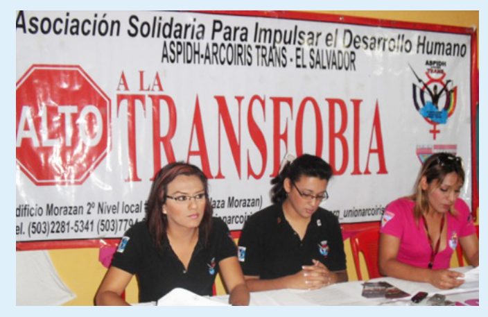
Members of GMT Initiative grantee partner ASPIDH advocate for transgender rights in El Salvador.

Since 2007, amfAR has been serving the HIV-related needs of gay men, other men who has sex with men (MSM), and transgender individuals (collectively, GMT) throughout the developing world through its GMT Initiative. Through small, targeted grants to grassroots groups, amfAR helps expand access to HIV education and prevention services; supports