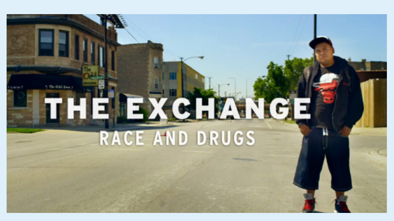
An image from The Exchange , amfAR's short documentary advocating for ending the ban on federal funding of syringe exchanges