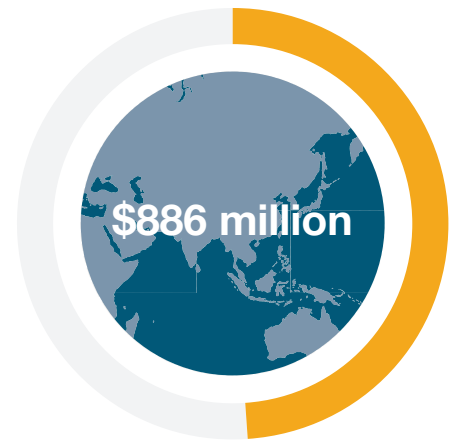
Global Fund contributed 49.6% ($886 million) of the total invested in ARVs in 2017.

In 2017, the GF spent $886 million on ARVs in PEPFAR countries, and it is frequently the primary purchaser of ARVs for an entire country. In these areas, such as Malawi where HIV prevalence is 10% and the GF purchases nearly 100% of the ARVs, PEPFAR relies heavily on GF investments to reach its goals.