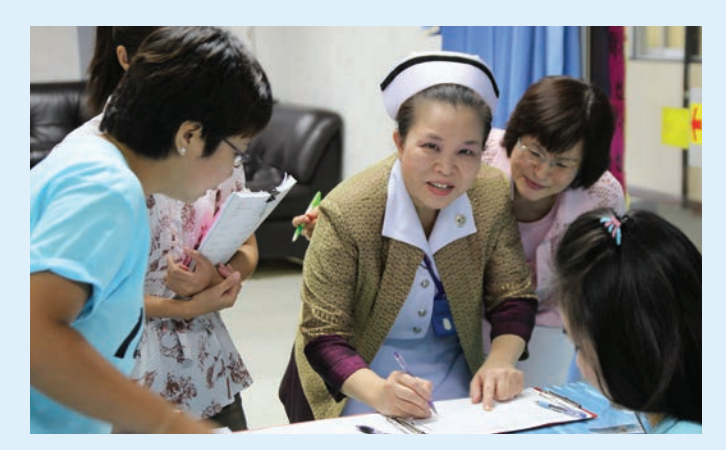
Nurses and counselors from Lampang Hospital, Thailand, attended a "test and treat" workshop organized by TREAT Asia in June, 2012.