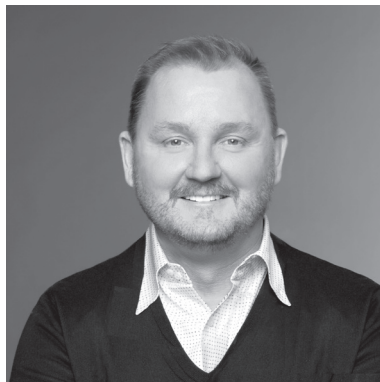
Kenneth Cole Chairman of the Board