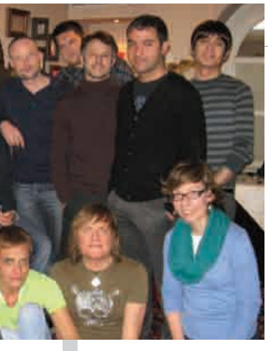
Reviewers met in Turkey to select MSM awards for Eastern Europe and Central Asia.

The TREAT Asia writing workshop was funded by the Office of AIDS Research at the U.S. National Institutes of Health. ■