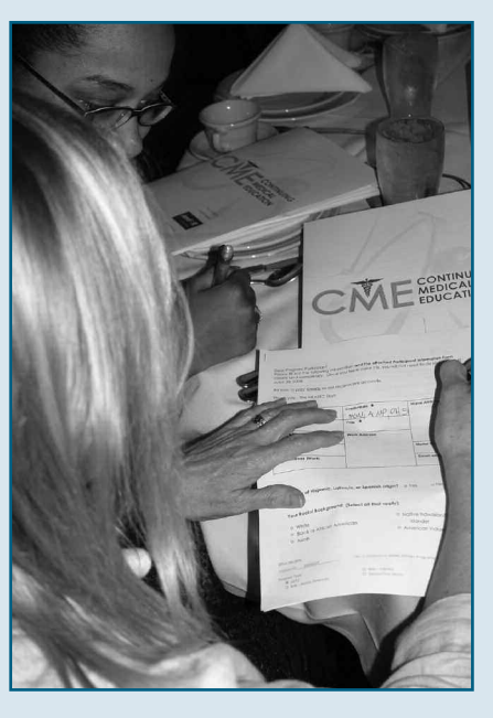
More than 500 medical professionals attended amfAR's continuing education program aimed at helping select HIV drugs for treatment-experienced patients with few options.

One of the goals of amfAR's CME program is to broaden the reach of educational activities—in this case by providing specialized HIV training to mid-level providers who often interact very closely with HIV-positive patients. Additionally, by holding programs in Atlanta and Raleigh-Durham, NC, the series in part targeted the South, where there is rising prevalence of HIV. The series, which ran from June 6 through October 17, was also conducted in Albany, NY, Boston, Denver, Indianapolis, Kansas City, MO, Los Angeles, Portland, OR, and San Diego.