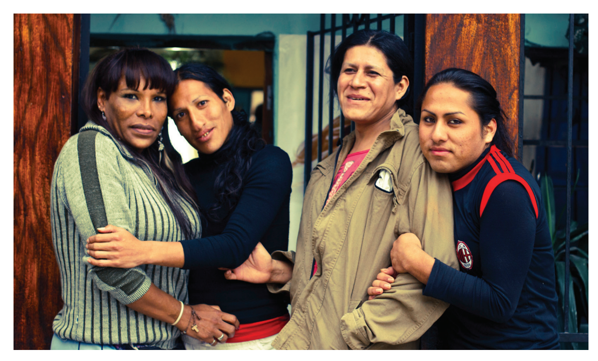
IESSDEH members in Lima

the project coordinators. The research also revealed alarming data about the community HIV prevalence: 30% of the trans community was HIV positive, while the rate among the general population was 0.4%.