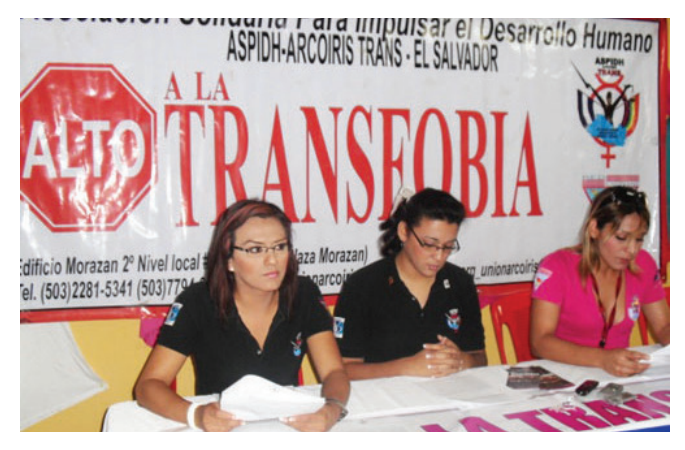
ASPIDH members promote trans healthcare rights.

The organization was founded in 1996, but could not obtain legal status until 2009. That year ASPIDH created its own community center called We Are Healthy with support from amfAR, Pan American Social Marketing Organization (PASMO), UNDP, and the Global Fund. The center serves as a community meeting place and provides HIV prevention materials and combined HIV testing, counseling, and support services in coordination with public hospitals.