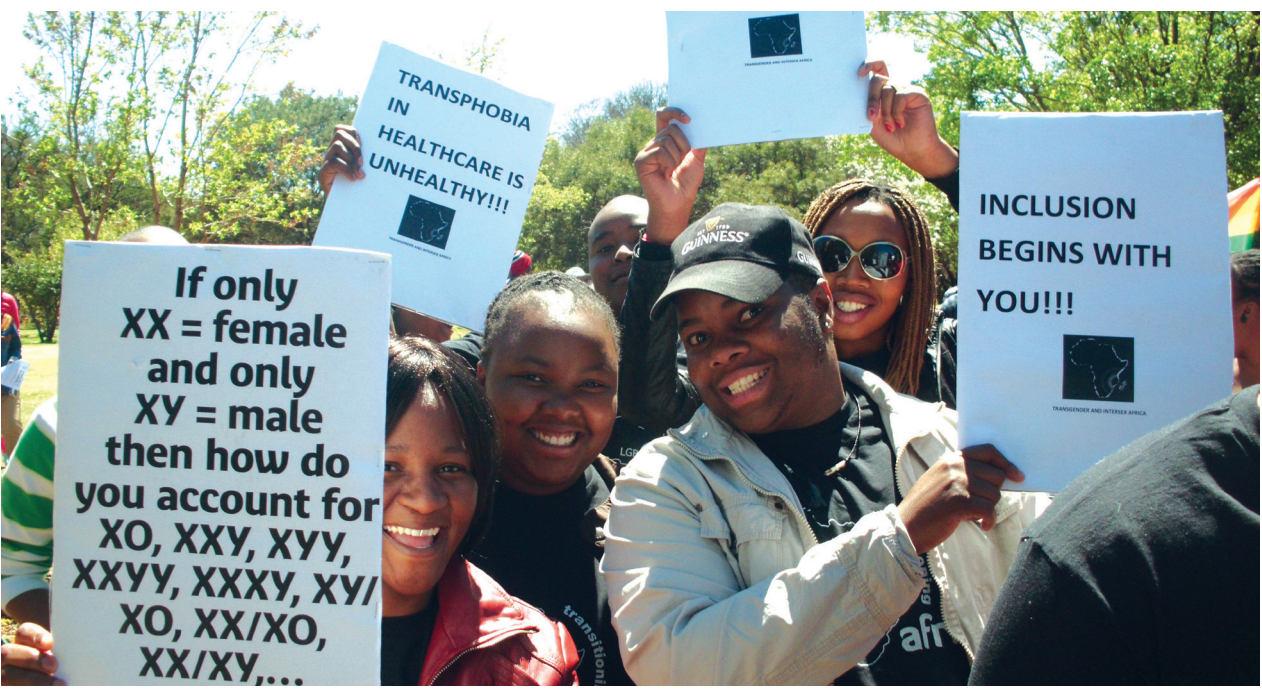
TIA members celebrate pride in Soweto, South Africa.