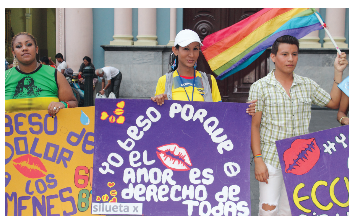
Members of Silueta X during a Kiss-In they organized on International Day Against Homophobia and Transphobia