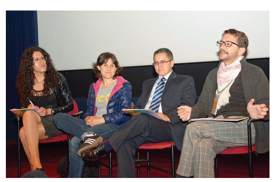
Alfil members participate in a panel.

Alfil Association was founded in 1999 as a support organization for gay men, but has grown to include lesbians, bisexuals, and trans individuals. In 2005, the organization decided to address the impact of structural vulnerability on the trans community in Ecuador. This work involves several strategies, including advocating the government for policy changes, documenting violations of trans individuals' human rights, and providing trainings for personnel from public health institutions on how to offer trans-appropriate HIV counseling and care. Currently, Alfil's work on trans issues is focused on overcoming the obstacles to accessing healthcare faced by the trans population.