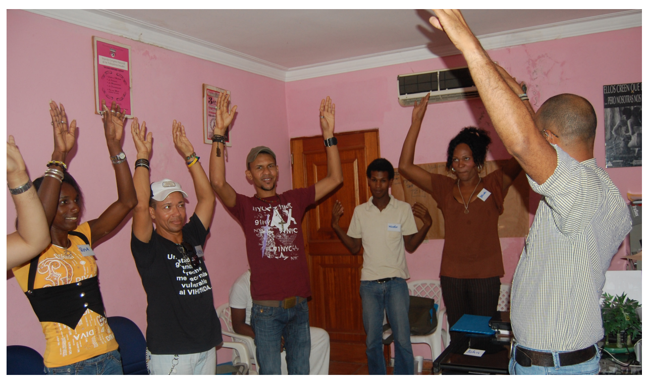
Members of COIN participate in a workshop for peer educators in Santo Domingo, Dominican Republic.