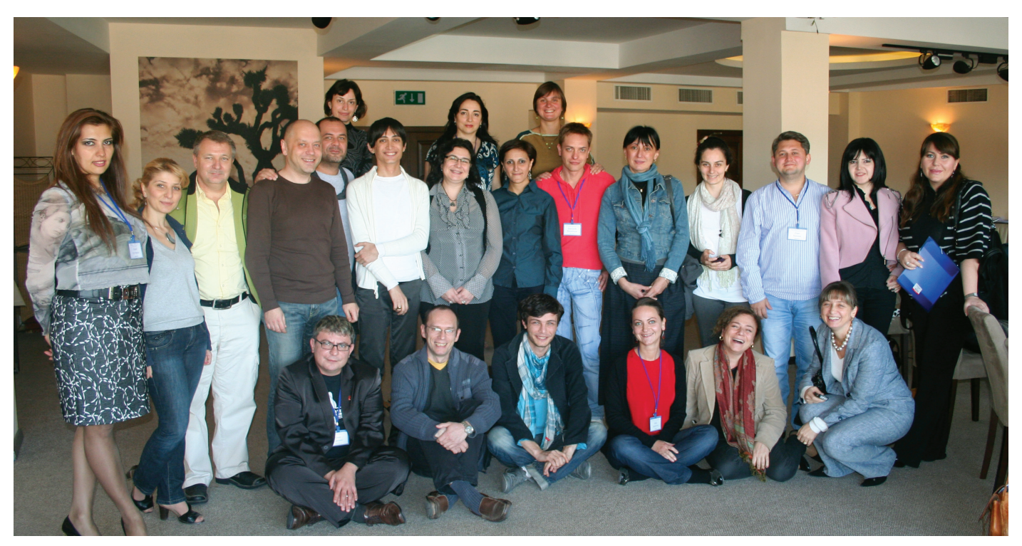
Regional LGBT activists from the South Caucasus at a Tanadgoma/amfAR-supported meeting to discuss trans issues

After this success, Tanadgoma realized that fulfilling the mandates of the conference required having deeper knowledge and understanding of the specific experiences of trans people living in the sub-region. With renewed support from amfAR, the organization designed a qualitative research study to document that situation and to then use the results as an advocacy tool in the three countries in the sub-region.