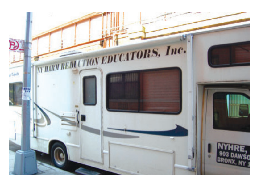
New York Harm Reduction Educators operates mobile syringe exchange sites that provide lifesaving services in communities throughout New York City.

consequences. <sup>13, 14, 15</sup> SSPs have helped New York City—where 50 percent of all IDUs were living with HIV in the early 1980s—approach the elimination of new drug-related transmissions, saving federal and state taxpayers millions of dollars in treatment costs averted. <sup>16, 17, 18</sup> SSPs make neighborhoods safer (for police, sanitation workers, and the general public) by supporting the safe disposal of potentially infectious needles and syringes. <sup>19, 20</sup> SSPs also facilitate recovery from drug abuse by linking drug users to treatment services. <sup>21</sup>