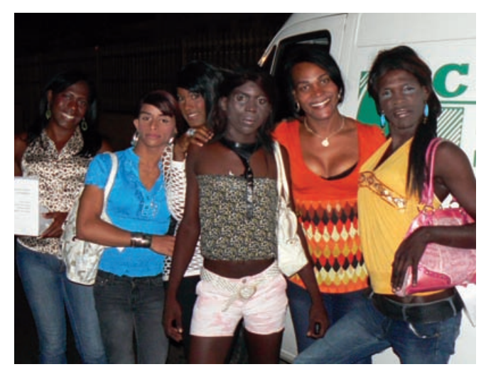
COIN offers prevention, care, and testing through its mobile clinic.

There aren't many other opportunities for trans women in this region to come together. Miercoles con Mama has been a good opportunity for the women to realize they have similar problems.