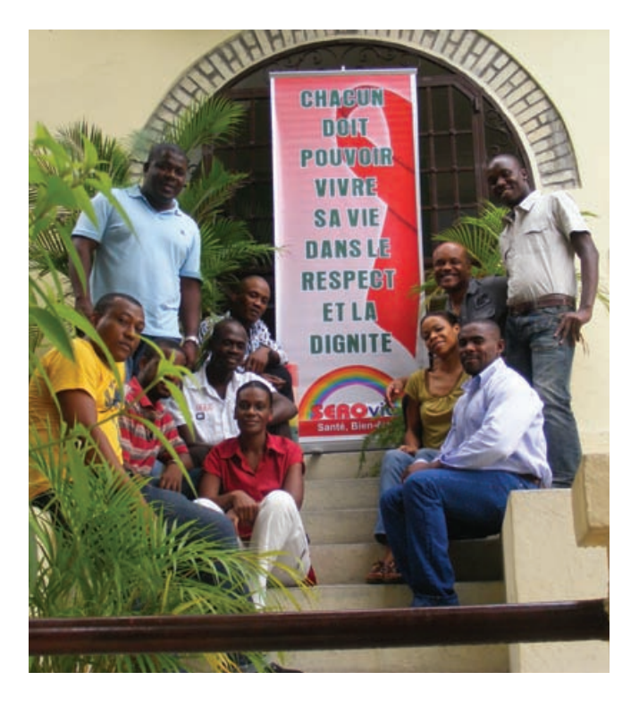
Staff and clients of SEROvie. The group's banner reads, "Everyone should be able to live his life with respect and dignity."

In a small courtyard in Port-au-Prince, the staff and volunteers of Fondation SEROvie work under the protection of five tents. The tents have taken the place of SEROvie's modest office building, which was reduced to rubble in the devastating Haiti earthquake of January 2010. Since then, the team at SEROvie, like so many other Haitians, has learned to carry on despite profound hardship.