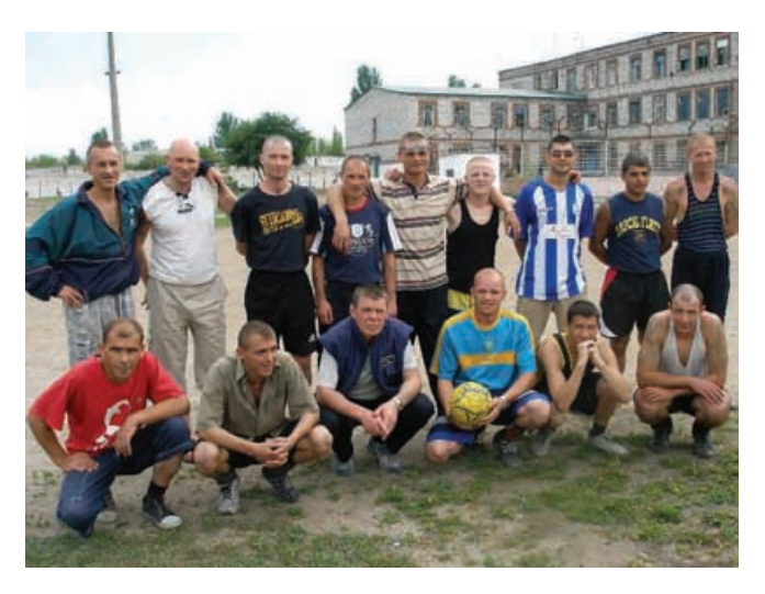
Winners of the Sport Against AIDS football match

Most important, the level of knowledge about HIV prevention and sexual health has increased significantly knowledge that MSM inmates will carry with them when they re-enter society.