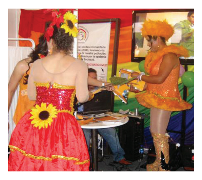
The amfAR-supported Inmensa stand at the Global Village in the Latin American Forum on HIV/AIDS 2009 in Lima. A group of transgender people from Inmensa provided prevention information.

Providing a safe space. A safe space provides MSM and transgender people with a place to gather that is free from harassment, discrimination, and judgment; a place where individuals are encouraged to speak, share information and problems, strategize on collective action, and engage with others. Like many organizations profiled here, Inmensa in Peru began its work with gay men by establishing a community space where clients, volunteers, and staff from grassroots MSM groups could meet to run workshops, hold meetings, or simply to socialize. Without this safe space, Inmensa's capacity building activities would not have been possible.