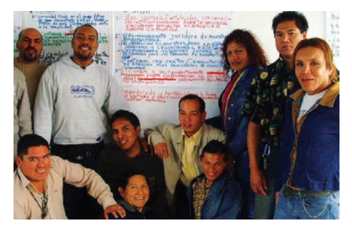
LGBT community leaders attending a strategic framework and management session

MSM and transgender groups in Lima are dispersed widely across the city and in most cases they have not coordinated their activities. Yet while MSM comprise the largest proportion of HIV cases in the country—prevalence is more than 15 percent, far greater than the general population, which is less than one percent<sup>5</sup>—they suffer from lack of recognition and remain on the margins of the health system.