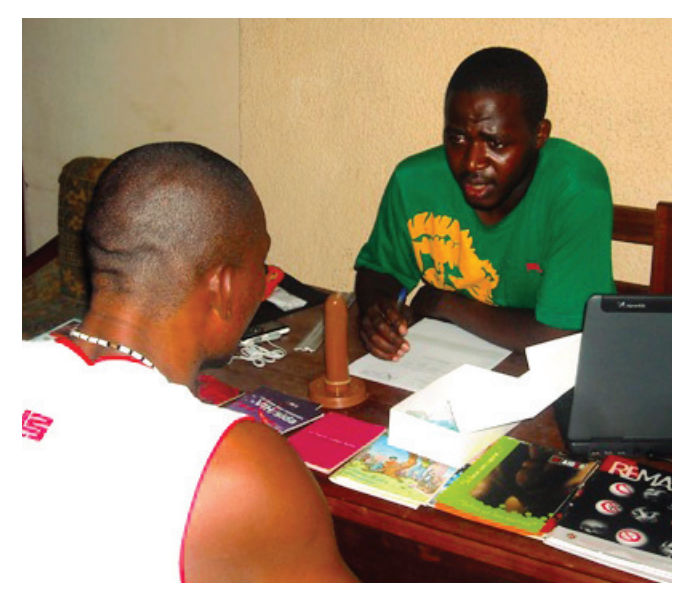
Alternatives Access Centre's medical director conducting a behavior change communication session with a client

The core of Alternatives' programming is the Access Centre—a wellness center for MSM that offers primary healthcare services and referrals, and hosts discussions, debates, and support groups. Along with basic services, the center provides a safe space for MSM to feel valued and find a sense of community. Through an outreach program to various health centers and civil society