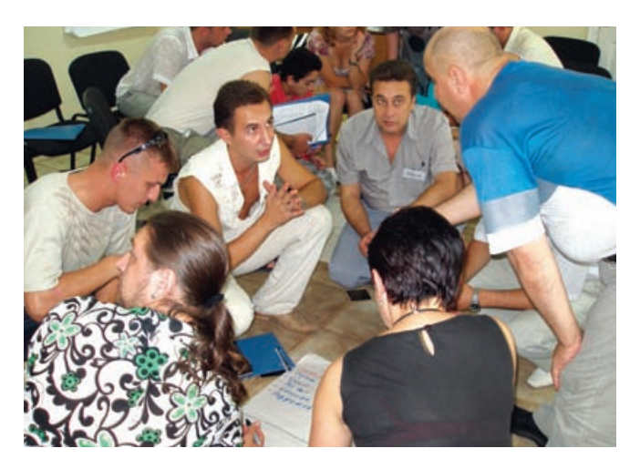
A seminar on MSM for staff of a Ukrainian prison and its clinic

Tailoring programs and adapting to change. Another lesson clearly reflected in these profiles is that programs must be tailored to the unique needs of each community. Sometimes this means adapting established interventions to address the requirements of a particular group. In Cameroon, for example, Alternatives-Cameroun has been able to increase uptake of their primary healthcare services and HIV referral systems by utilizing Internet outreach and by spreading the word through traditional West African men's social groups called Grins.