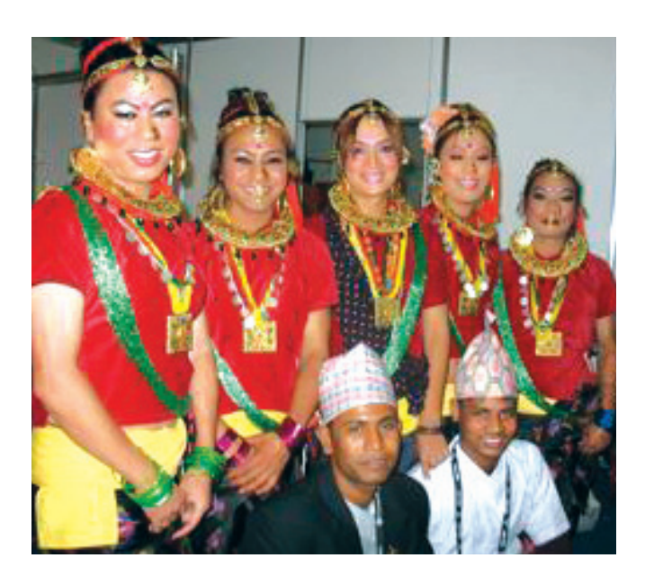
BDS members preparing for a cultural performance linked to HIV awareness activities

Blue Diamond Society has adopted a diverse approach to service delivery. It starts by creating safe spaces to foster interaction and imparting self-care and life skills training. With offices in 30 districts, networks in 50, and one hospice devoted to caring for HIV-positive MSM and transgender people, the organization