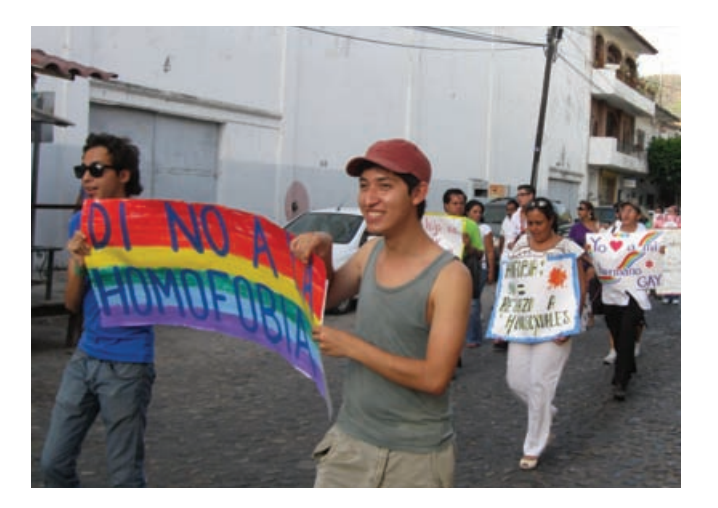
VES members march against homophobia in Puerto Vallarta.

address the HIV-related needs of MSM and transgender people. Advocates must demand significantly increased investment in peer-led community-based HIV programming.