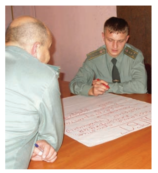
A seminar on MSM for staff of the prison and its clinic

In less than three years, this project has made significant headway in breaking down the barriers to HIV education and social support among MSM in Ukrainian prisons. To change the culture of prison attitudes toward MSM and open the door for HIV prevention efforts, the Penitentiary Initiative has employed multiple strategies, among them training prison staff, supplying HIV prevention kits to MSM, organizing support groups, and providing access to social and mental health counseling.