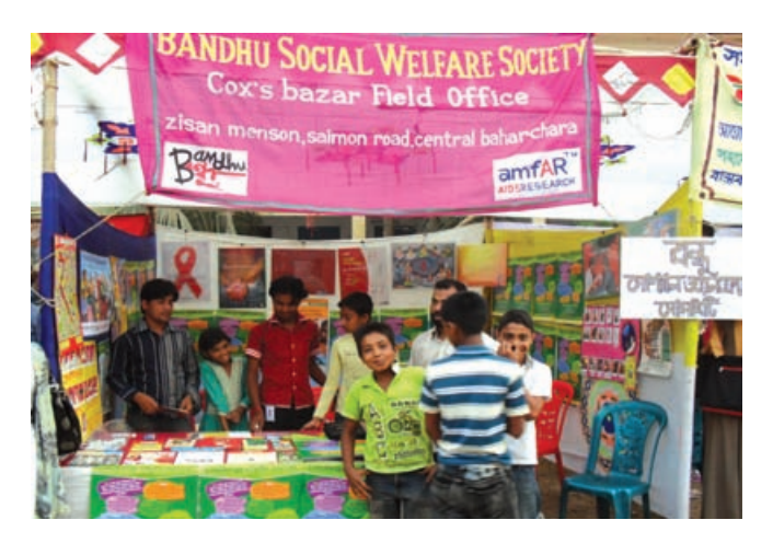
Bandhu's booth at a health fair in Cox's Bazar, Bangladesh, provided a safe space for MSM and LGBT individuals to gain information.

Long before global health organizations recognized the urgency of fighting HIV among MSM, the Bandhu Social Welfare Society in Bangladesh began working on the sexual health and human rights of MSM and transgender populations. With its extensive experience beginning in 1996, the group has been able to develop a wideranging series of successful programs, including education and outreach among MSM and transgender networks, socializing and community-building activities, HIV prevention and sexual health programming, human rights advocacy, and capacity building.